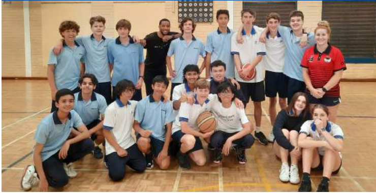
Basketball Leadership Program

Our Year 11 group will have a separate event for their own year group, a formal river cruise on the Crystal Swan. The date of this event will be advised in 2023.