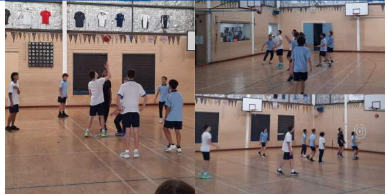
referee matches Australia wide.

Over the ten-week program, students developed their on-court and teamwork skills through hour long sessions before school with expert coaches. They have also completed their level 0 coaching course and "green shirt" refereeing course, allowing them to coach teams and